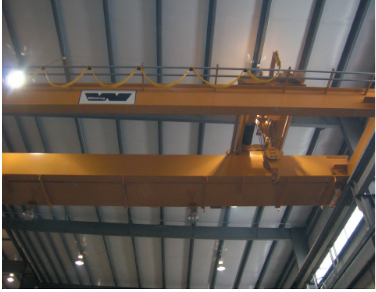
Whiting's overhead crane manufacturing plant.